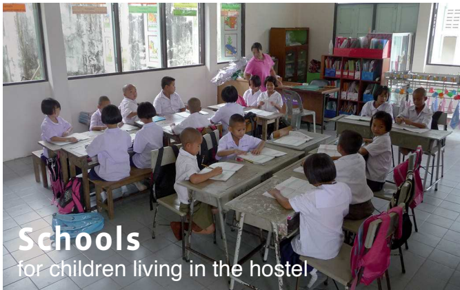
Schools for children living in the hostel.

Primary schools in nearby villages - secondary school in Thoeng approx. 70 km from the hostel - universities Chiang Rai, Chiang Mai, Lampang, Prayao.