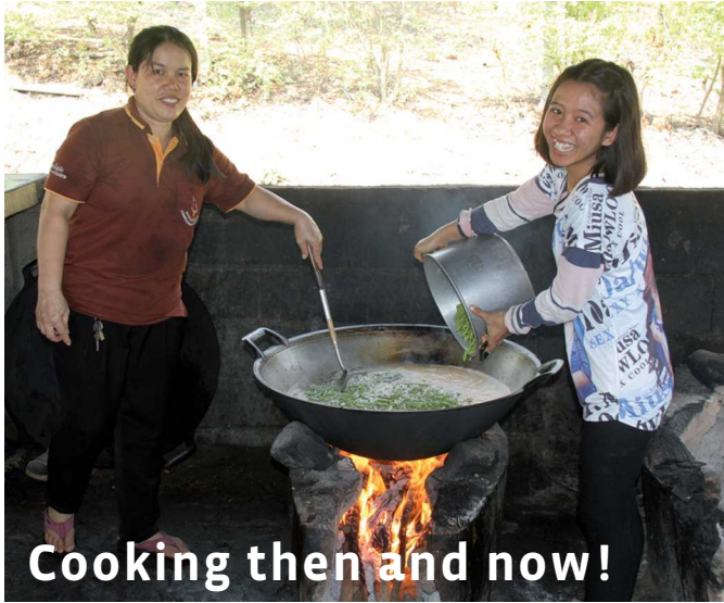
Cooking then and now!

In the early days of our life together, our meals were prepared as in the tribal villages, i.e. a fire under the roof, prepared from 4am so that the rice/vegetables were ready for breakfast - evening meal, same story!