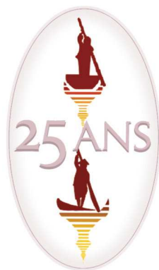
First logo - lifeboat from shore to shore - from darkness to light Second logo - boat touching the saving shore

To save children from a harmful destination, the Smile Foundation tries to gather as many as possible, in order to prepare them for a better future. They are welcomed into a family home, where they are educated, clothed, fed and housed. But not only that - the "School of Life" pedagogy has proved