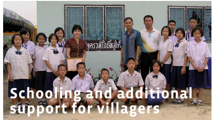
Schooling and additional support for villagers

To find the villages of the various ethnic groups, you have to leave the main roads and take small paths that are often hidden and difficult to reach. And there, another world awaits us. Large families living in clans with a village chief. Their hut, often only one room, is used for cooking on a fire, eating on the ground and sleeping next to each other. The rest of their life is spent outside. The women/children in the fields, the men discussing 'business' while smoking 'their pipes'!