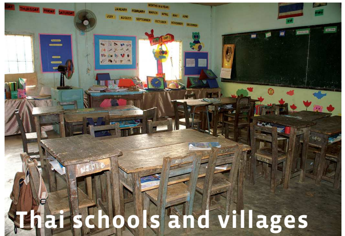
Thai schools and villages

If there is a school structure in one of the villages, we sponsor children from a distance to enable them to stay with their families. It is in this kind of village that Le Sourire has opened a nursery to take care of small children by two young girls. On the other hand, school meals, libraries and school material in general are financed. Le Sourire also helps VERY poor families who have one or more sponsored children.