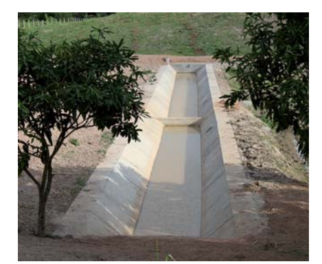
Improvement of the irrigation system

In Sion, opening of «LA BOU-TIQUE» in aid of the Sourire and the association «Couleurs de Chine». Members of these two associations have put together and offer second hand clothing for sale with brisk sales throughout the year. This activity started in 2009 in a non-official way in private apartments. The schooling of the children is their primary objective.