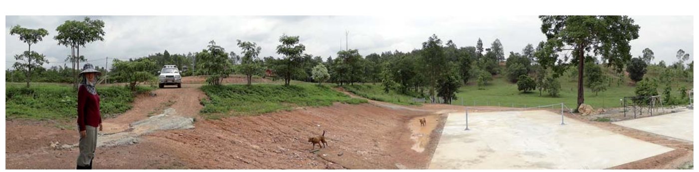
Entrance to the home areal

During this year, heavy rains devastated Thailand with dramatic consequences. Even if we regularly suffer from violent storms, the home of the Sourire was saved thanks to the solid construction built on stilts. Nevertheless, our ponds overflowed and hundreds of fish were thrown out on to the banks. It was necessary to save our food fast by cleaning, preparation and consumption! The flooded access road, heavily damaged, was repaired by our young «professionals»!